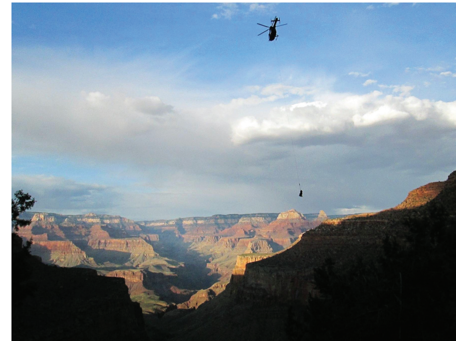
Grand Canyon rescue

My wife and I spent seven years working with the National Park Service in remarkable locations including Yellowstone, the Grand Tetons, and the Grand Canyon. In my last job, I managed the Preventive Search and Rescue Team (PSAR), a group of EMTs and Paramedics that provided safety messaging as well as 911 services for the 7 million people that visit the Grand Canyon. It was an amazing job, but my wife, who is a RN, and I always had an eye on the Gunnison region. There's a closeness of community in this place surrounded by incredible beauty. After working in highly remote regions with the NPS, moving here was like coming to the big city. Our kids are thriving with all the opportunities available through the amazing school district, as well as wilderness activities. It sounds cheesy, but we are totally living our dream.