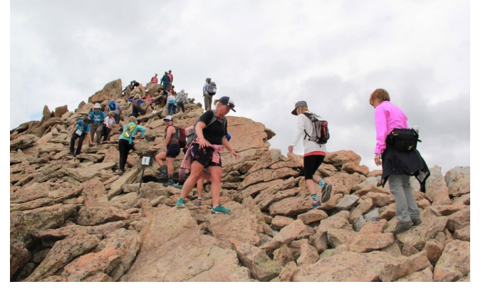
The GVH Foundation sponsored the Living Journeys Annual Summit Hike in Mt. Crested Butte in July.